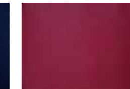
Plum Red #43