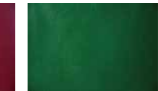
Shamrock Green #45