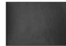
Smokey Gray #2 (standard)