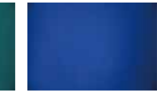
Sea Blue #7