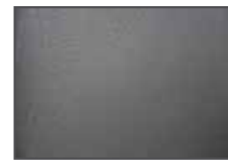
Sterling Gray #1