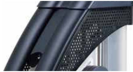
CHARCOAL PANTONE 433C