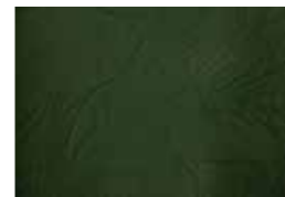
Forest Green #14