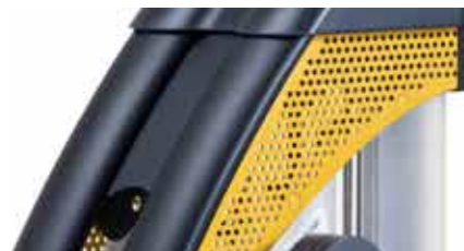
YELLOW PANTONE 123C