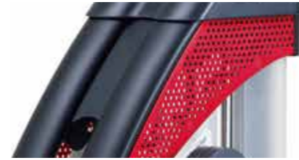
RED PANTONE 185C