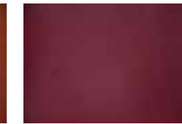
Maroon Red #5