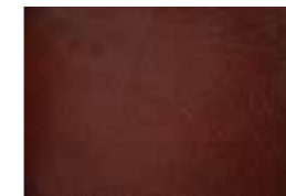
Burnt Orange #15